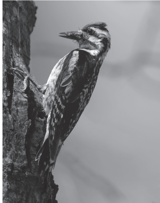
Figure 5. The Yellow-bellied Sapsucker is a common road-crossing species in northeastern British Columbia, especially where nesting occurs near road edges and foraging areas are on the opposite side. Kiskatinaw River, BC. 23 June 2006. (Michael I. Preston).

To our knowledge, there are no studies that have attempted to determine the probability of potential collision of birds with vehicles among different road types. Instead, of the few studies that do report on bird-vehicle collisions, the numbers reported are usually only of dead birds, and not of those that successfully cross. Those dead birds are then commonly presented as the number per unit of distance driven ( e.g. , Banks 1979, Sargeant 1981, Ashley and Robinson 1996) and mortality estimates are extrapolated to much broader geographic areas. From a limited number of studies, Banks (1979) estimated that the total number of birds killed on roads in the United States was highly variable and ranged between 10.7 and 380 million birds per year. The National Wind Coordinating Committee (2001) has since revised that estimate to an average of 80 million birds per year, accounting both for new information from more recent studies, as well as the increased amount of roads and vehicles.