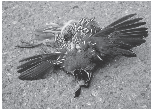
Figure 1. When crossing roads, species such as this California Quail ( Callipepla californica ) often prefer to walk rather than fly. Consequently, upon approach of a fast-moving vehicle, it is not uncommon for them to remain motionless - a natural reaction for these birds in response to predators. Near Keremeos, BC. 11 April 2003 (Michael I. Preston).

Height-dependent road crossing success by birds is a challenge to study empirically since most dead birds observed have no associated heights, and the proportion of total birds crossing the road within