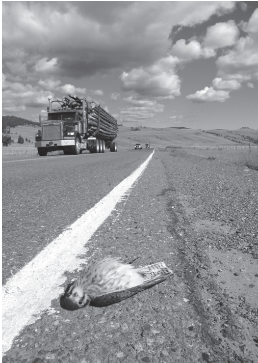
Figure 4. This juvenile American Kestrel, which was probably still learning to forage, met an untimely demise on Highway 5A near Stump Lake, BC. 18 July 2006. (Michael I. Preston).

bellied Sapsucker, whereby lower crossover heights on secondary and gravel roads tended to be more frequent than on primary roads. The Gray Jay, when crossing primary roads, preferentially crossed in height Class 3, compared to lower crossover heights on gravel roads. Differences in crossing heights among road types for these species may be a learned behaviour or an adaptation for reducing collision potential.