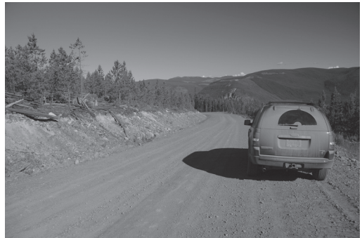
Figure 2. A typical gravel road used primarily for logging and access to gas wells in northeastern British Columbia. Near Kobes Creek, BC. 19 June 2006 (Michael I. Preston).

We determined that on average, birds in Class 1 are susceptible to collision with all vehicles, birds in Class 2 are susceptible mainly to large transportation trucks, and birds in Class 3 avoid collision altogether (Figure 3). While more precise probabilities would require knowing how many unsuccessful crossings versus successful crossings are made, and which vehicle types are involved, our goal is to provide general probabilities based only on crossover heights. Thus, if 100 birds are observed crossing roads, and 25 fly at \leq 1.8 m and the remainder fly > 4.6 m, then we estimate that the probability of potential collision is one in four, or 25%.