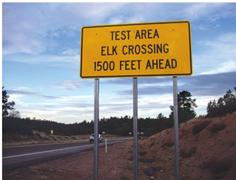
Norris Dodd, AZTEC Engineering

Researchers installed this sign in Preacher Canyon, AZ, to alert motorists that they are approaching the wildlife crosswalk testing area. This sign is located approximately 1,200 feet (366 meters) from the crosswalk.