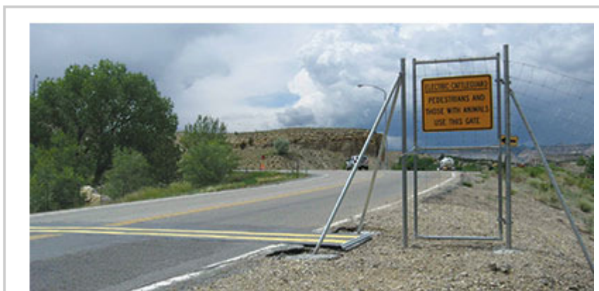
Richard Lampman, ElectroBraid

Signs used in combination with other strategies can increase the effectiveness of efforts to minimize wildlife-vehicle crashes. For example, where animal detection systems are installed, once a large animal is detected, warning signals can be activated to inform drivers that an animal might be on or near the road. A downside to activated warning signs, however, is that drivers could become acclimated to them and choose not to use caution. Similarly, motorists might acknowledge the warning, but, if they do not actually see an animal, they could choose not to slow down, thereby negating the purpose of the signs.